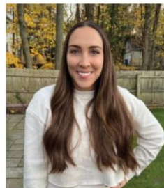
JACKLYN COHEN YOUNG LEADERSHIP AWARD